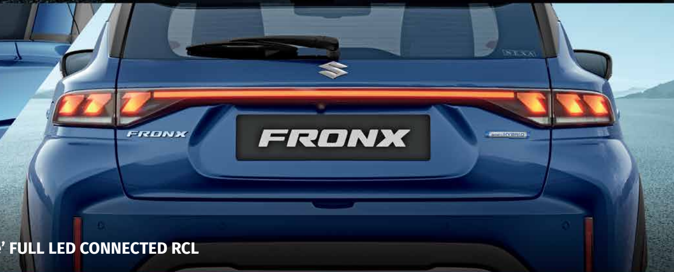
NEXTre' FULL LED CONNECTED RCL