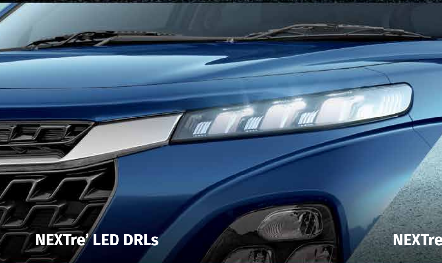
NEXTre' LED DRLs