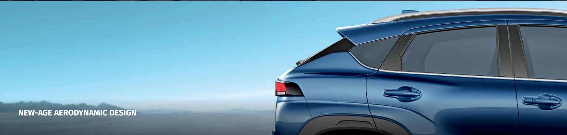
NEW-AGE AERODYNAMIC DESIGN