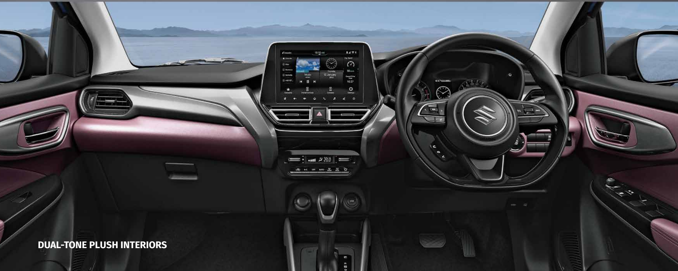
DUAL-TONE PLUSH INTERIORS

From the moment you step in, FRONX enhances the SUV experience with its structural precision and integrated function. The dual-tone dashboard with special forged metal finish and accents seamlessly connects the steering, infotainment system and rounds off the interiors in style. Cruise control and steering-mounted controls ensure you never have to take your hands off the wheel. What amps up the luxury for you, and yours, are details like the driver armrest; rear AC vents; and rear fast charging.