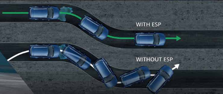
ELECTRONIC STABILITY PROGRAM